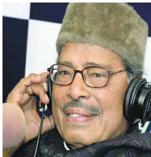
The Classic Soul Stirrer

Limited Seats: Ticket Sale Starts from June 1, 2009 For Seating arrangement and Ticket prices visit www.iava.us